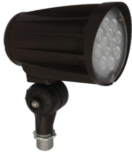
SMB LED Series