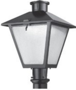
AL27 LED Series