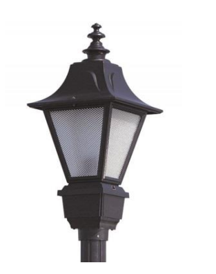
YCP LED Series