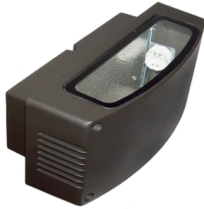
WSR Up/Down Series