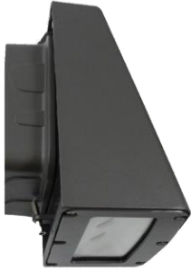
TSW LED Series