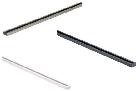
TK LED Series