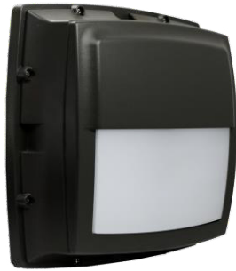
OSH LED Series