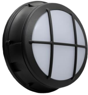
ORG LED Series