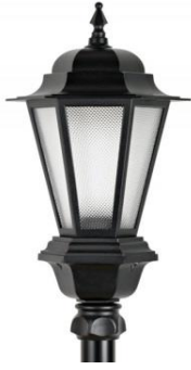
OCP LED Series