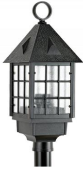
NCP LED Series