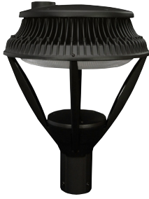
MSP LED Series