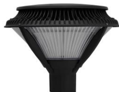
PD Poly Diffuser