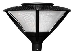
PD Poly Diffuser