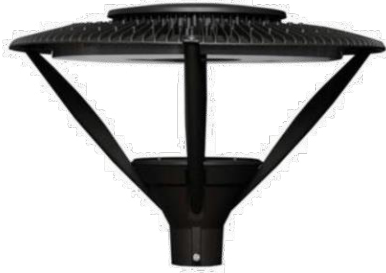
MLP LED Series