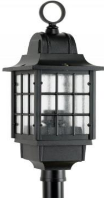
MCP LED Series