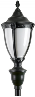
LCP LED Series