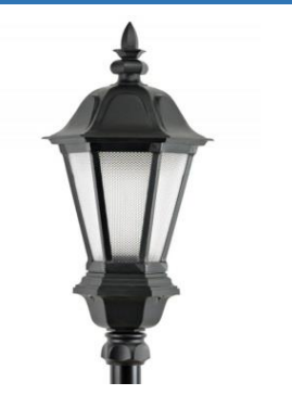
HCP LED Series