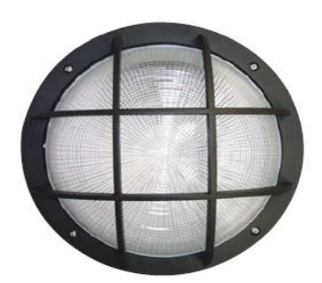
GRG LED Series