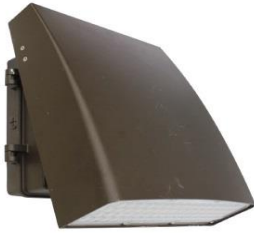
EWL LED Series