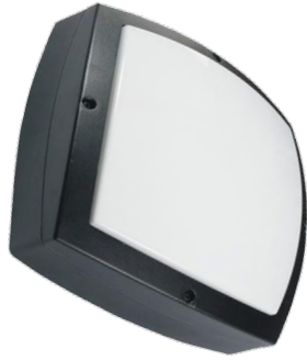
ESO LED Series