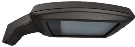
ABM LED Series