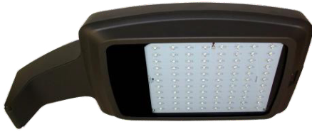
ABL LED Series