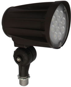
SMB LED Series