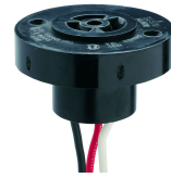
K121-30 Locking Type Receptacle, 3-Pin, C136.10 Compliant, 30" lead