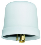
K4500 Shorting Plug for Locking Type Receptacles