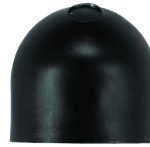
6LV1352 Light Shield Accessory for EK4036S, EK4436SM, K4000 Series Button Photocontrols