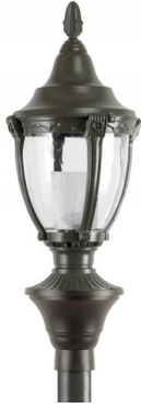
BCP LED Series