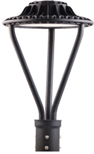
APT LED Series