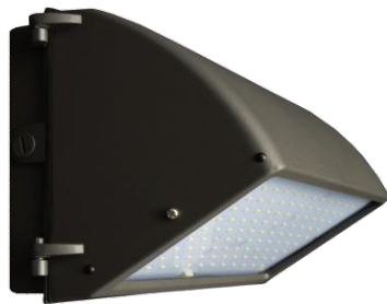
WSM LED Series