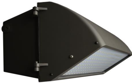
WSLD LED Series