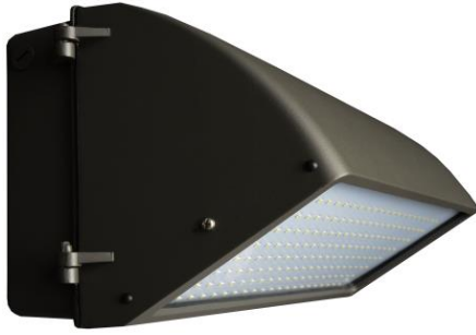
WSL LED Series