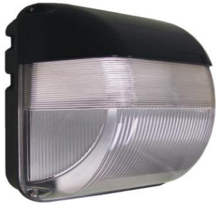
WPSS LED Series