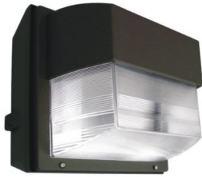
WPS LED Series