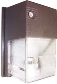
WPP LED Series