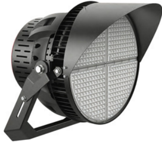
SPL LED Series