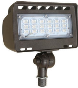
SMF LED Series