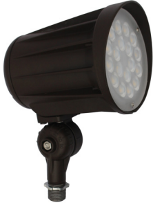
SLB LED Series