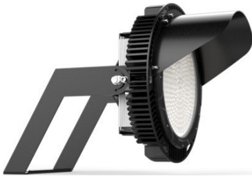
RSL LED Series