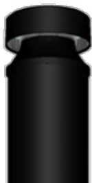
MB LED Series