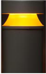
MB Amber LED Series