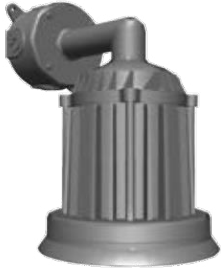
IW LED Series