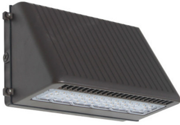
EWT LED Series