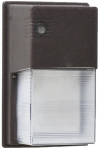
EWP LED Series