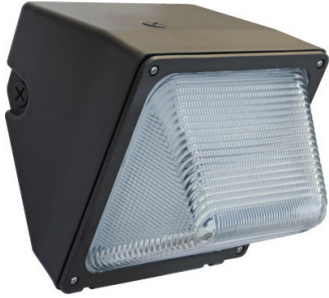
ESW LED Series