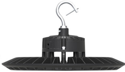
ESHB LED Series