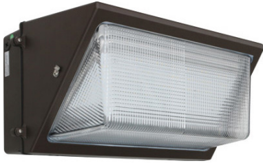
ELW LED Series