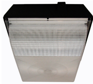
CVSL LED Series