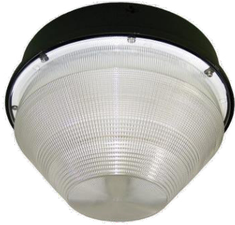
CVR LED Series