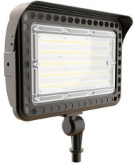
CMF LED Series