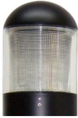
BG LED Series