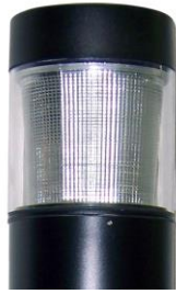
BFG LED Series