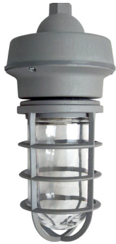
VPB LED Series