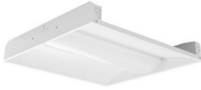
IT LED Series